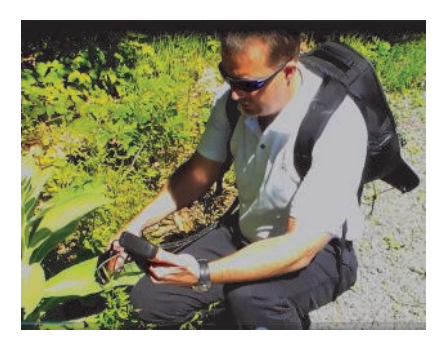
A field portable spectroradiometer provides valuable information for forest canopy research.