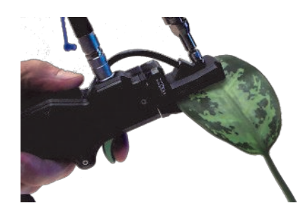
An optional leaf clip includes an internal reference standard.